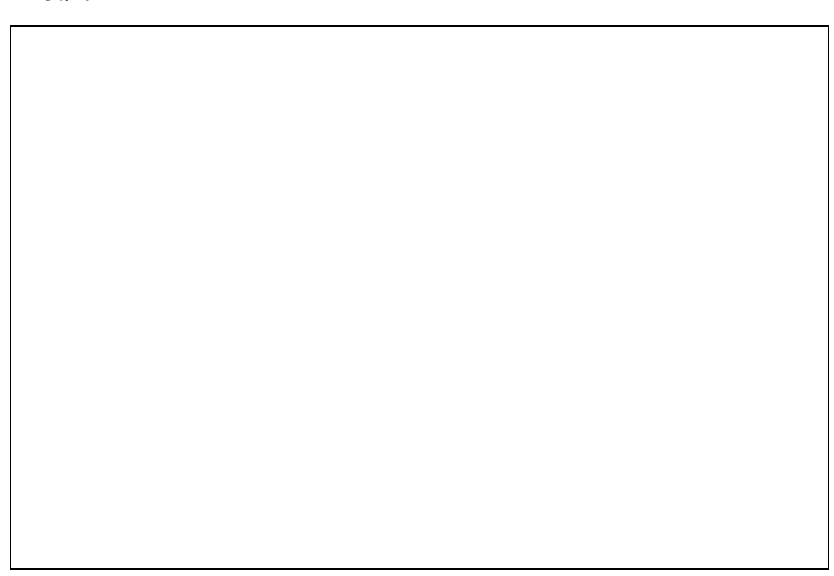
Figure 1: KTM-PS64 Memory Expansion Board

The KTM-PS64 Memory Expansion Board (shown in Figure 1) supports both extended (linear) and expanded (paged) memory options, and also supports Lotus/Intel/Microsoft Expanded Memory Specification (LIM EMS) version 4.0 software to enable memory paging. While EMS 4.0 remains compatible with applications written for EMS 3.2 and Enhanced Expanded Memory Specification (EMMS), you will get even greater performance benefits with applications written specifically for EMS 4.0, such as Microsoft Windows 2.0 and Quarterdeck Office Systems' DESQview.