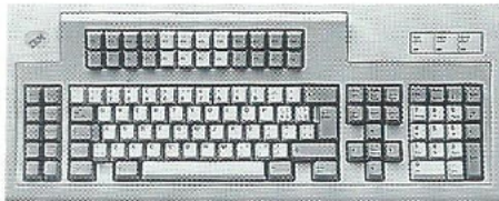
IBM Host-Connected Keyboard (122 keys), available in 1 of 11 languages