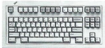
Space Saving Keyboard (84 keys), available in 1 of 3 languages (U.S. English, Canadian French and Spanish)