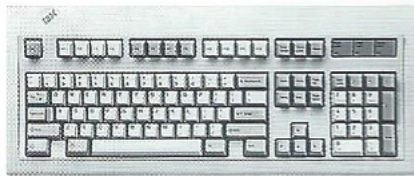
PS/2 Enhanced Keyboard (101 keys), available in 1 of 11 languages